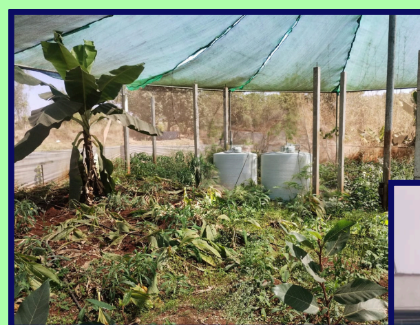
ISV Student Project 2023 - Smart Aquaponic Farming - JSPMRS College, Pune

ISV Student Project 2023 - Solar powered Water Purification - NIT Mizoram